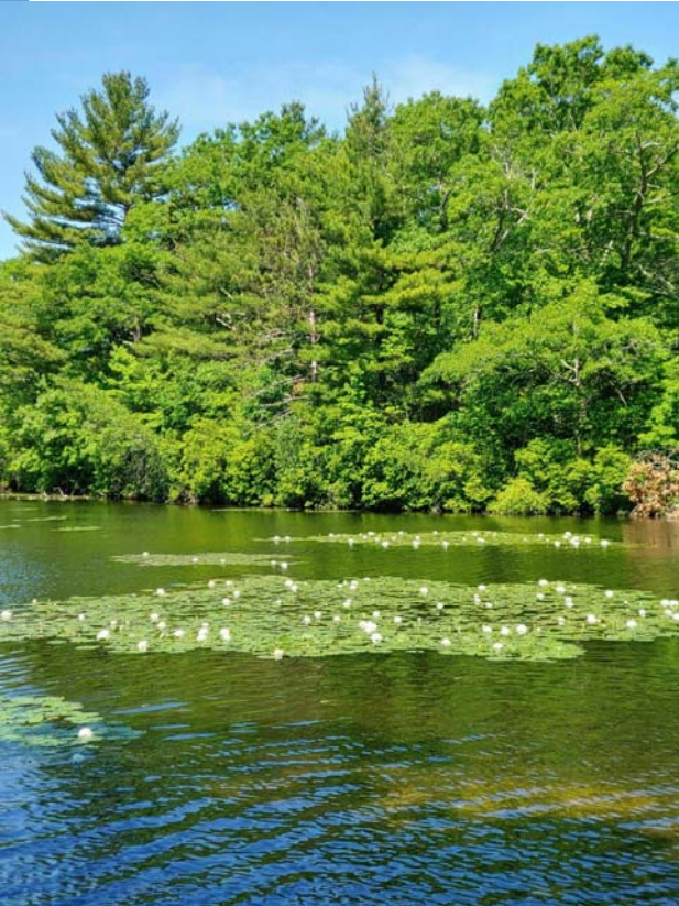
Image: D.W. Field Park

Source: https://www.alltrails.com/trail/us/massachusetts/dw-field-park--2/photos