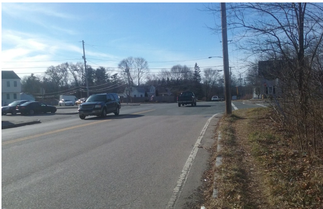
Brockton Avenue (Route 123) at Mill Street and Green Street, Abington; the worn path along the side of Route 123 shows the need for a sidewalk linking neighborhoods to Wal-Mart.