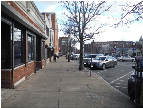
Wide sidewalks on Legion Parkway (Route 123) Brockton