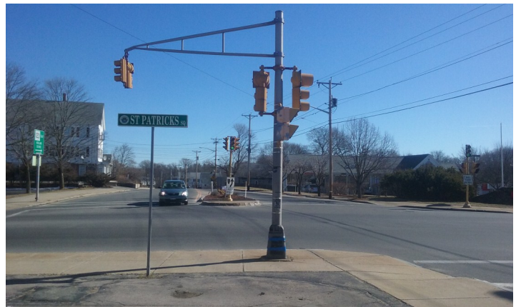
Centre Avenue at Washington Street and Orange Street, Abington, shows a skewed geometry.