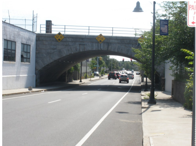
Historic Stone Arch Railroad Bridge on Crescent Street (Route 123 West), Brockton with limited height clearance.