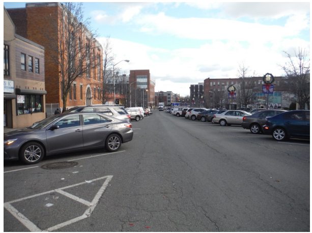
Angle parking on Legion Parkway (Route 123) Brockton