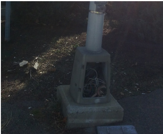
Signal post at Centre Street (Route 123) and Quincy Street, Brockton