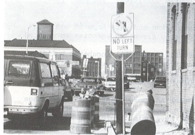
Construction progresses on Hazardous Intersection Elimination Program.