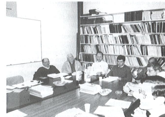
OCPC Joint Transportation Committee members consider the Transportation Improvement Program Priorities.