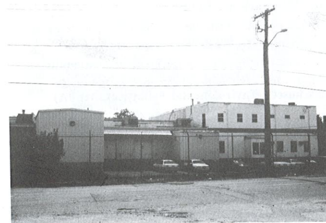
MIFA bonds approved by OEPD for expansion of the UNO Foods - Brockton Plant.