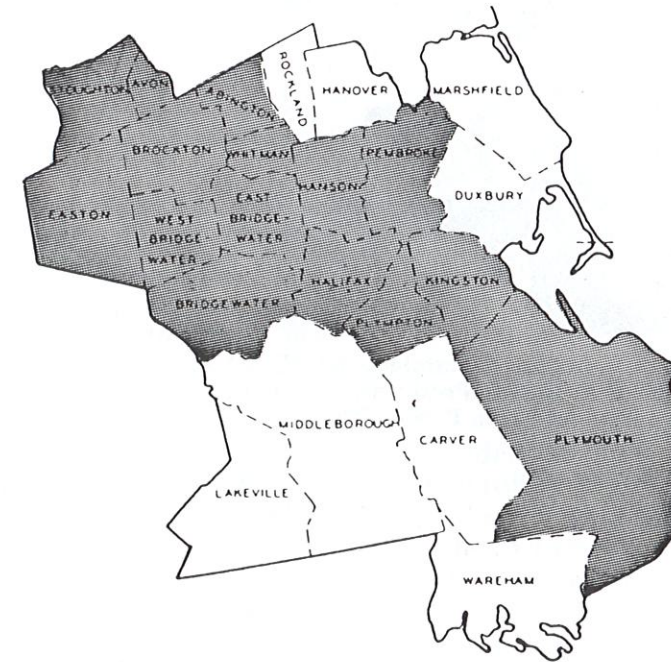
AREA AGENCY ON AGING SERVICE AREA