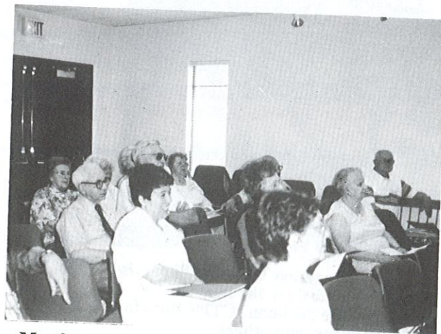
Members of the Area Agency on Aging Advisory Committee hear presentation on Nutritional Needs of the Elderly.

During Fiscal Year 1993, the Area Agency participated in a statewide elder needs assessment effort coordinated by the Executive Office of Elder Affairs. In cooperation with the Councils on Aging in the region, a random sample of 400 elders was selected to receive a mail survey. One hundred forty-seven elders completed the survey resulting in a 37% response rate.