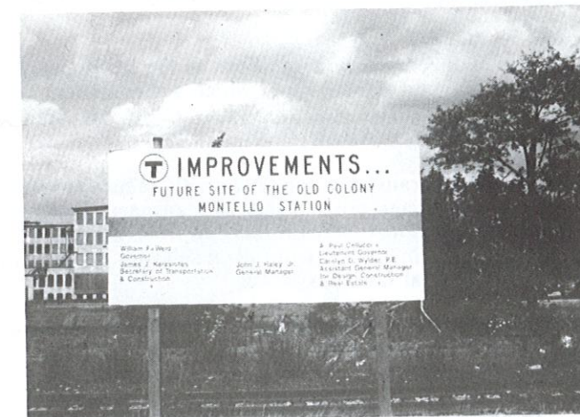
Site of Future Montello Old Colony Commuter Rail Station.