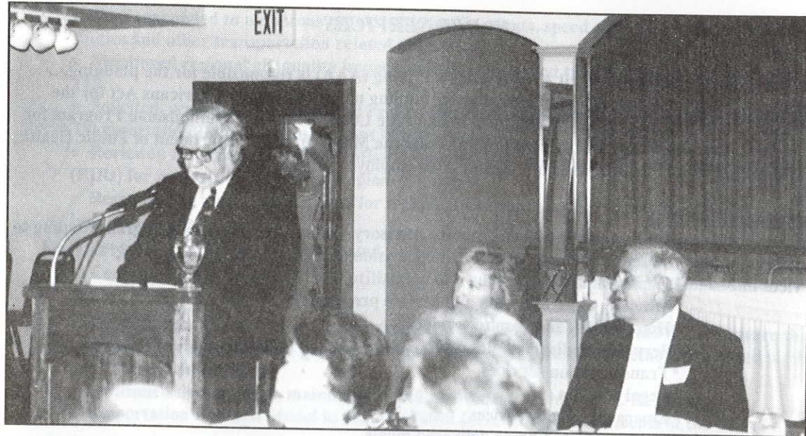
CONGRESSMAN J. JOSEPH MOAKLEY ADDRESSES THE 1998 OCPC AAA ANNUAL LUNCHEON MEETING.